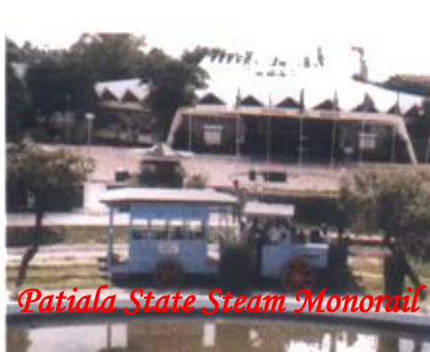
Patiala State Steam Monorail